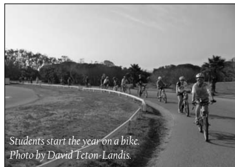
Students start the year on a bike.